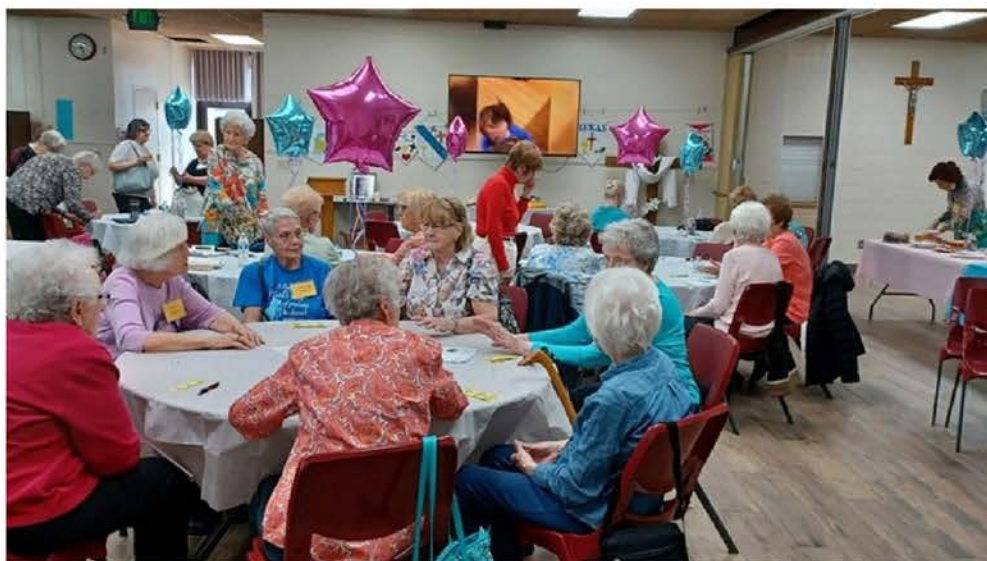
St. Martin de Porres Baby Shower, April 12